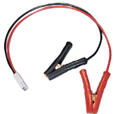
Alligator Clamp Battery Interface P/N 874-946-20