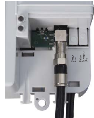
Coax F-Style Interface