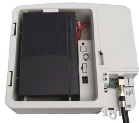
FlexPoint FPR1207-F Shown with cover removed, battery installed, coaxial cable and power cables connected

For contact information visit www.alpha.com