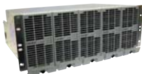
Typical 18kW 19" Shelf