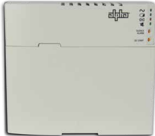
FP1208-F Series UPS with battery cover for 5 to 8Ah battery