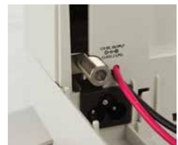
Coax F Connector: Output