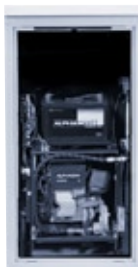
CE-3x 3.5 or 5kW