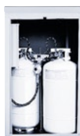
CE-3/9G Propane Storage for Generator