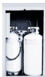
CE-3/9G Propane Storage for Generator