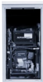
CE-3x 3.5 or 5kW