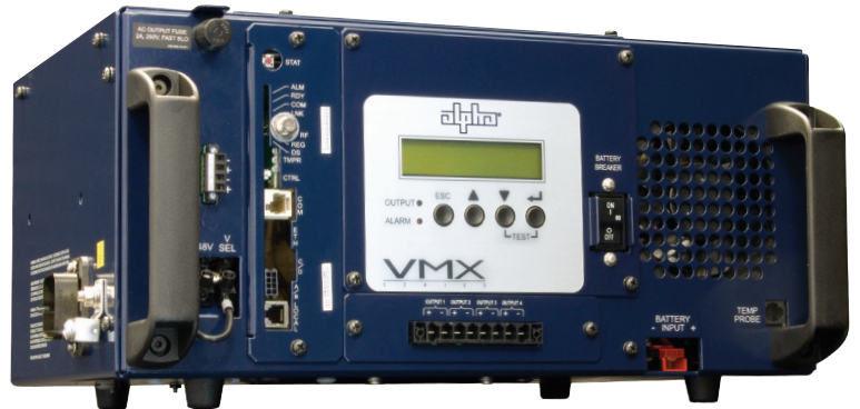
VMX - Shelf Mount