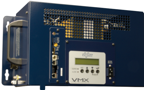
VMX - Wall Mount