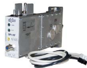
Service Power Inserter (SPI-RF) with RF port