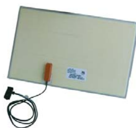
Battery Heater Mat (BHM)